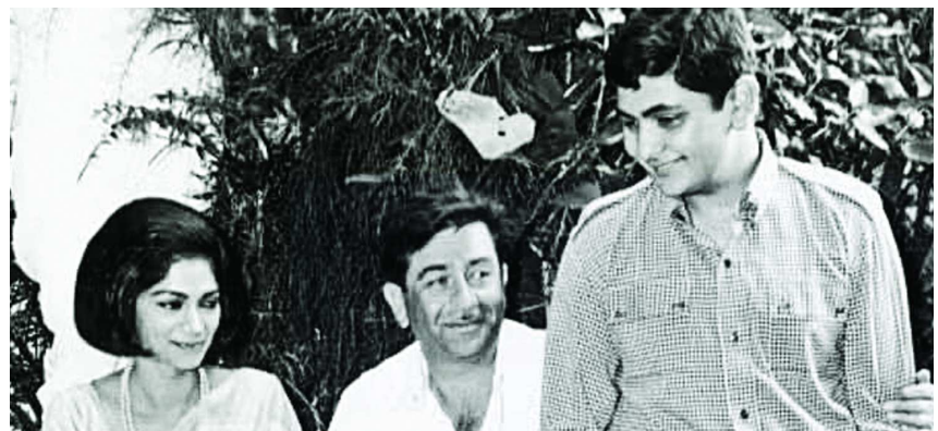
Raj Kapoor's 100th Birthday: Rishi Kapoor has made a revelation about Raj Kapoor in his book 'Khullam Khulla: Rishi Kapoor Uncensored', which surprised everyone.

Raj Kapoor: Ranbir-Riddhima's grandfather Raj Kapoor has also been a good cook, your mouth will water after hearing his favorite dish