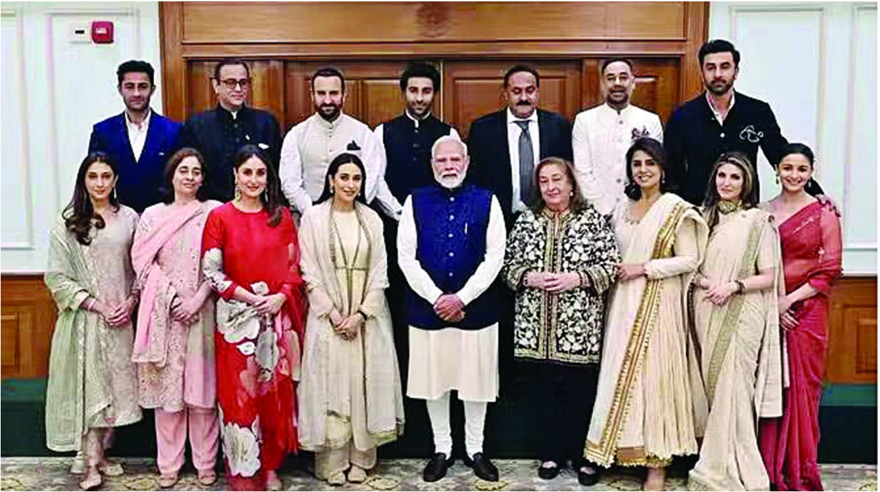
Raj Kapoor's 100th Birthday: Rishi Kapoor was afraid of Raj Kapoor drinking alcohol, this fear always haunted him-The other side of the story

the blanket as soon as he heard the sound of his father entering the house. He shared "The moment my father would come home staggering, I would hide under my quilt, trembling but alert, my eyes wide open, to hear what he was saying or doing? When I would hear his voice slowing down, he would walk towards his room, then I would calm down and breathe easily."