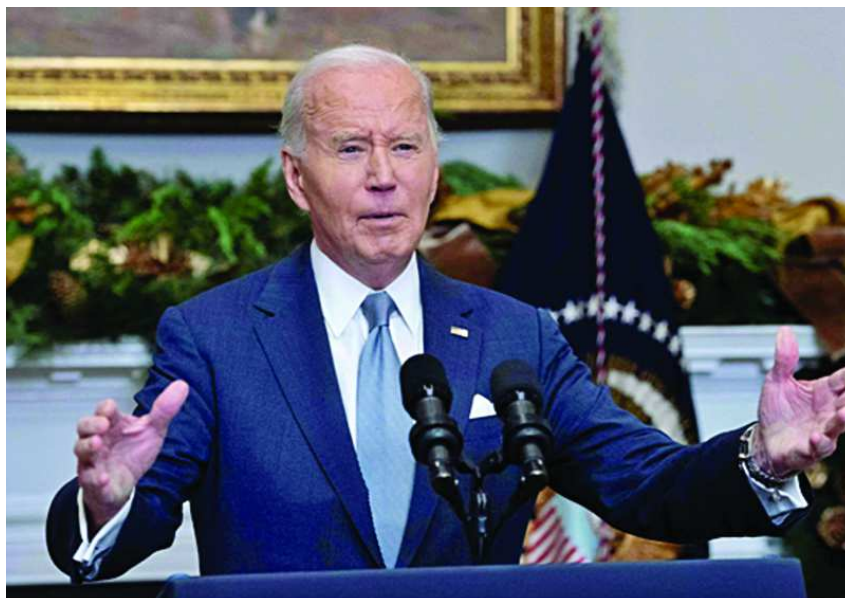
US President Joe Biden speaks about the situation in Syria in the Roosevelt Room at the White House in Washington, DC

It is also a moment of risk and uncertainty, Biden said, adding that over the past few weeks, the support of Hezbollah, Iran and Russia to the Assad regime had col-