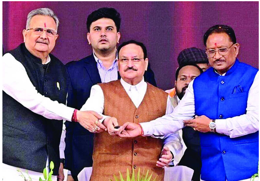
BJP National President JP Nadda presenting works worth Rs. 1124 crores while CM Sai and CG Assembly speaker Dr. Raman Singh support him

The government led by Prime Minister Narendra Modi in the country and Vishnu Deo Sai in Chhattisgarh is working diligently to serve the people. As a result, the entire country and the state are witnessing