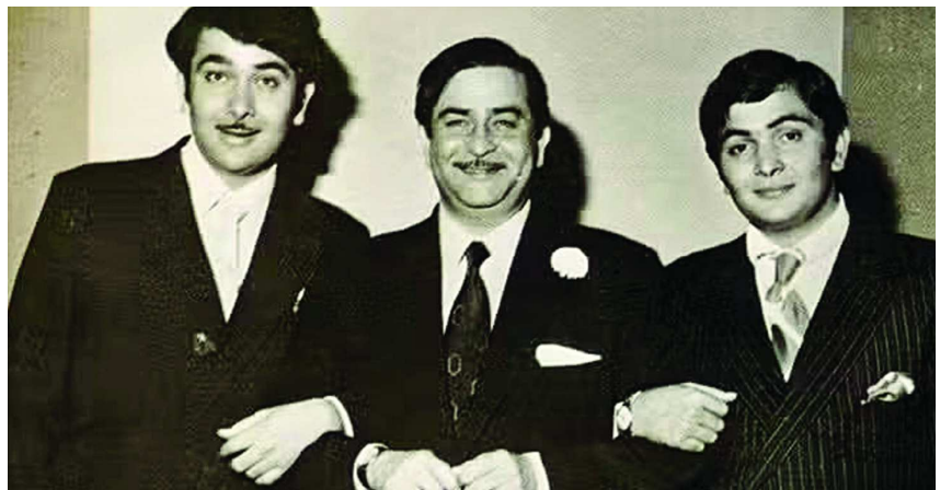
Mumbai will host the centenary celebrations of late filmmaker-actor Raj Kapoor on Friday December 14 , 2024 . Several legends of the Indian film industry will come together at the grand event to be held in Mumbai's Andheri West area.

According to media reports, the entire Kapoor family, including Randhir Kapoor, Karisma Kapoor, Kareena Kapoor Khan, Ranbir Kapoor, Alia Bhatt and others, will unite at the event to pay tribute to the late filmmaker. The biggest stars of Hindi cinema,