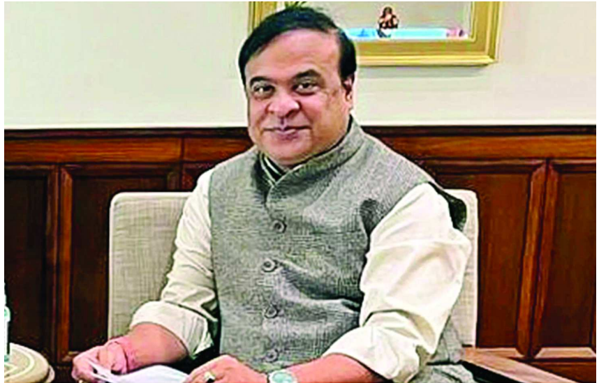
Assam chief minister Himanta Biswa Sarma

Arguing that the arrest of dozens of infiltrators from Bangladesh has forced them to strengthen the system, the