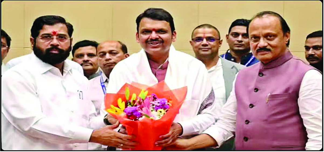
First cabinet meeting of Mahayuti government